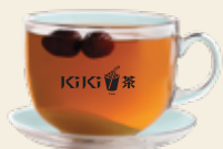
黑糖紅棗薑母茶 Brown Sugar Ginger Tea, Red Dates $34