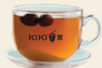
黑糖紅棗薑母茶 Brown Sugar Ginger Tea, Red Dates $34