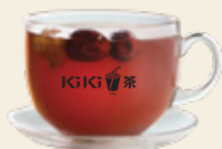
桂圓紅棗茶 Homemade Longan and Red Dates Tea $32