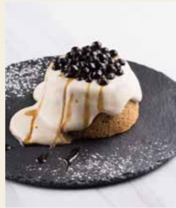
伯爵戚風蛋糕配黑糖珍珠 Earl Grey Chiffon Cake, Brown Sugar Pearls $68

所有價目以港幣計算; 需加一服務費 All prices are in Hong Kong Dollars; subject to 10% service charge