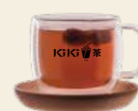
黑糖紅棗薑母茶 Brown Sugar Ginger Tea, Red Dates $34