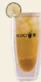
金鑽鳳梨青茶 Pineapple Green Teapresso $38