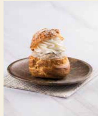
KiKi 烤茶泡芙 KiKi Roasted Tea Cream Puff $38