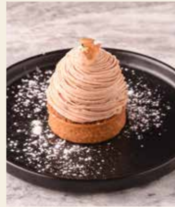
栗子蒙布朗 Chestnut Mont Blanc $38