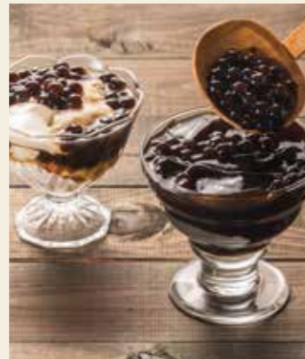
豆腐花珍珠 Tofu Pudding, Brown Sugar Pearls $28