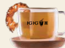
金鑽鳳梨青茶 Pineapple Green Teapresso $35